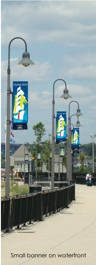
Small banner on waterfront